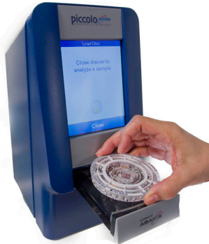
Piccolo Xpress® Chemistry Analyzer

Routine multi-chemistry panels for Point of Care (POC) testing, with results in less than 15 minutes.